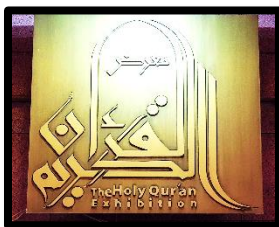
The Holy Qur'an Exhibition

Proceed to Medina by bus (5hrs). Sahur before reaching Medina and check-in hotel. Visit Tomb (Maqam) of Prophet Muhammad ﷺ and his companions like Abu Bakar and Umar , proceed to Baqi' cemetery (make salam to Rasullullah's family, companions, etc.), then perform sunnah prayers at Rawdah . Iftar at masjid. After prayers return to hotel for dinner. Isya' prayer and Terawih.