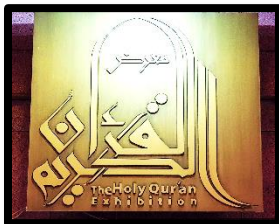
The Holy Qur'an Exhibition

Tawaf and Sai Umrah followed by Tahallul. Free day . You are encouraged to spend more time in religious propagation, supplication in prayers and recitation of the Quran inside the Holiest Mosque (Multiplication of 100,000x prayers), Masjidil Haram .