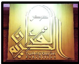
The Holy Qur'an Exhibition

Baqi' cemetery (make salam to Rasullullah's family, companions, etc.), then perform sunnah prayers at Rawdah . Free time for worship.