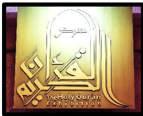
The Holy Qur'an Exhibition

Free day . You are encouraged to spend more time in religious propagation, supplication in prayers and recitation of the Quran inside the Holiest Mosque (Multiplication of 100,000x of good deeds), Masjidil Haram .