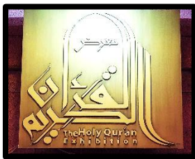
The Holy Qur'an Exhibition

Rasullullah's family, companions, etc.), then perform sunnah prayers at Rawdah . Free time for worship.